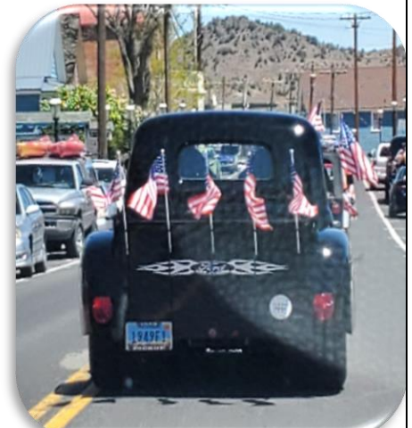
Hero Cruise in Carson City