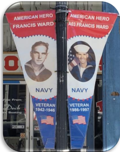
Honoring our Heroes