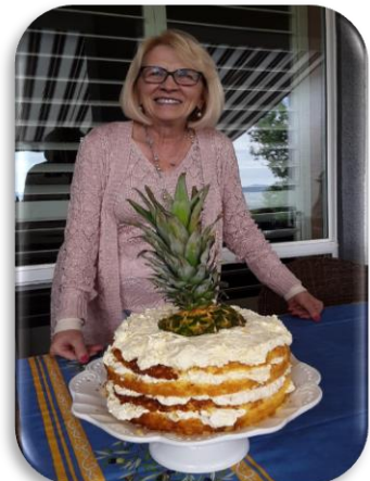
Mother's Day Memories