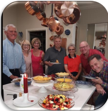
Mother's Day Memories