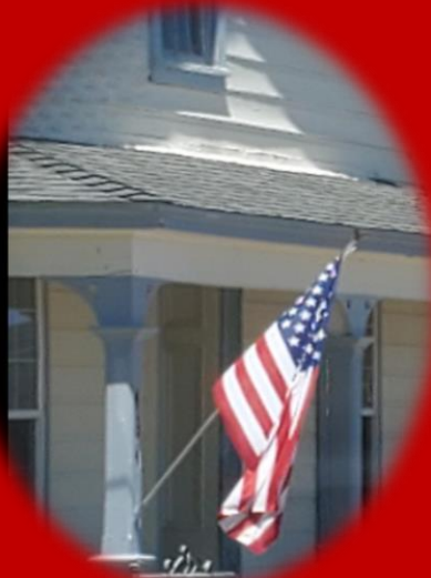
Honoring our Heroes