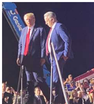
Sheriff Joe Lombardo, candidate for Governor with President Trump