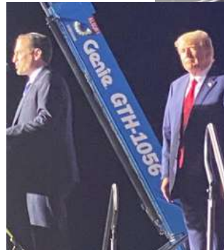
Adam Laxalt and President Trump