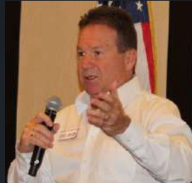
George "Eddie" Lorton, Candidate for Reno Mayor