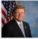
Mark Amodei (i)