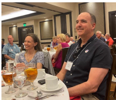
Andrew's proud parents!