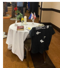
Missing Man Table