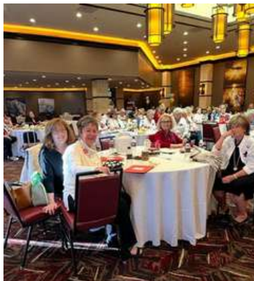
Our motley crew!