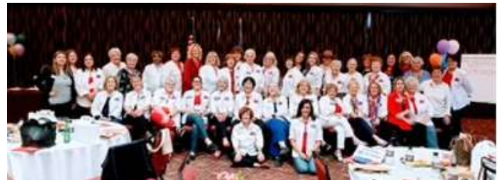
Great Turnout Ladies!