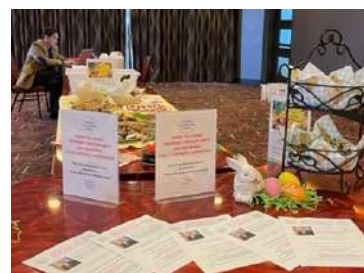
Goodies, handouts and auction!