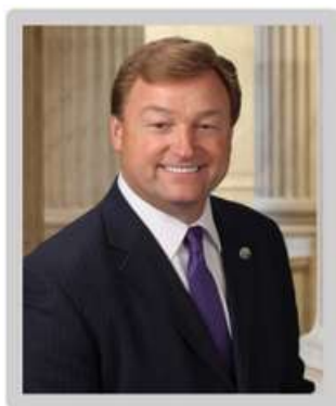
DEAN HELLER Candidate for Governor