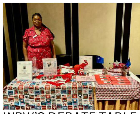
WRW'S DEBATE TABLE

One of the key topics of discussion was increased border security. The candidates presented their ideas on how to address this crucial issue while balancing national security with compassion.