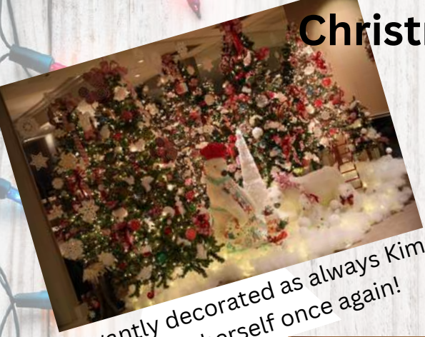
Elegantly decorated as always Kim out does herself once again!