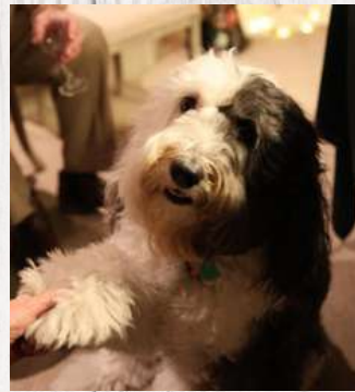
Caia welcoming guests with a handshake