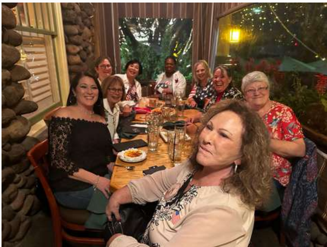
Northern and Southern ladies gathered for dinner at Stone house Cafe Friday night before the convention.

The Nevada Federation of Republican Women (NvFRW) held its annual convention on Saturday, October 28, 2023, at the Atlantis Hotel in Reno, Nevada. One of the main topics of discussion at the convention was the organization's bylaws concerning the eligibility/requirements for the President position. Several members expressed concerns about certain aspects of the bylaws, and there was a lively discussion about how to address these concerns. However, no resolution was reached at the convention. Despite the lack of resolution, many members expressed optimism that the bylaws committee will be able to address the concerns that were raised.