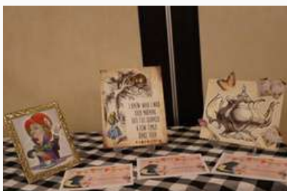
Mad Hatter Tea Party Member Appreciation on April 1, 2023