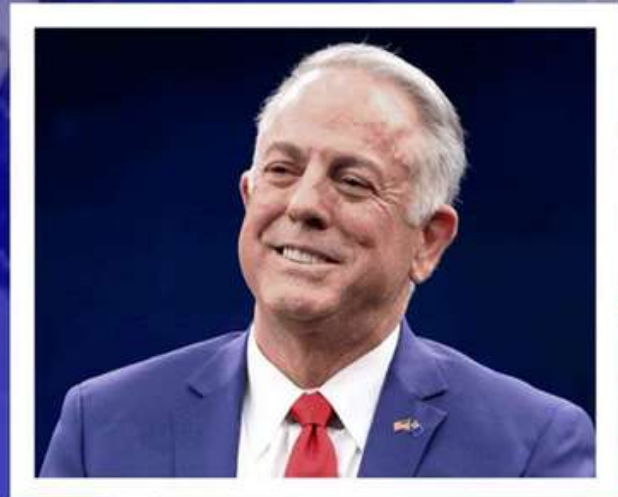
Governor Joe Lombardo