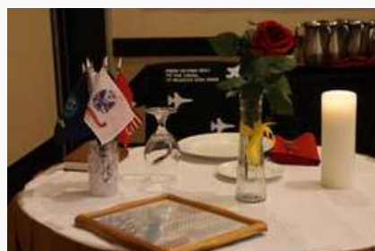
Missing Man Table honoring our military members who are MIA/POW