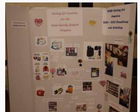
Caring for America Project: Reno Sparks Gospel Mission