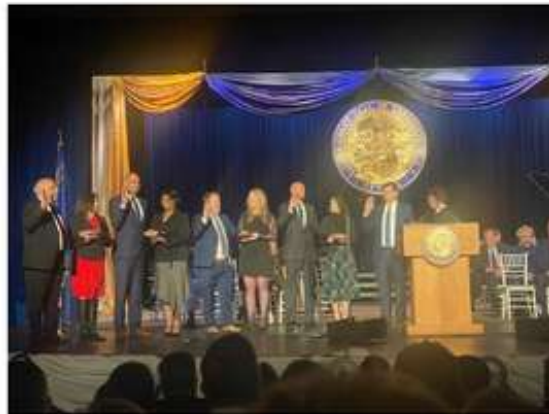
Swearing in of Nevada's Constitutional Officers

continue to provide their volunteer services