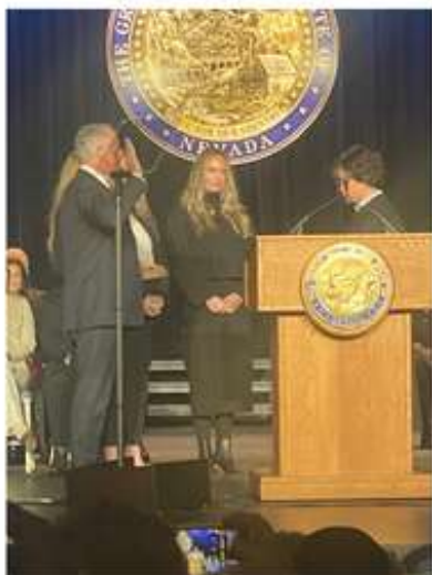
Governor Lombardo gives the Oath of Office